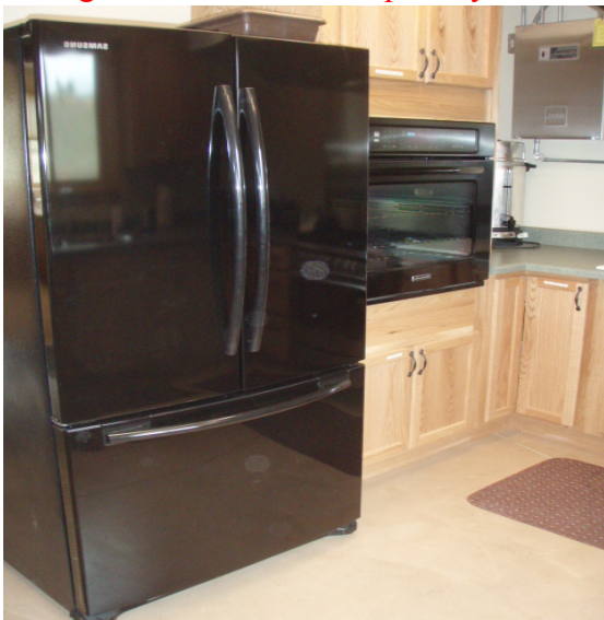
This fridge can hold whatever you like!