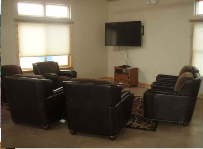
Cozy TV viewing area