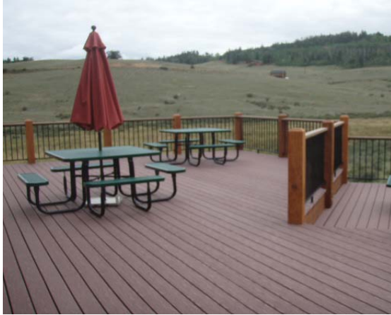
Spacious deck with covered tables