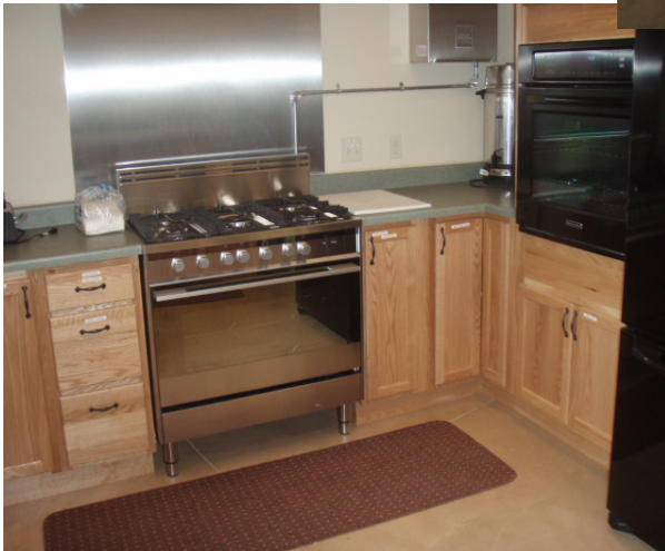
Large Ovens and Stovetop— Any ideas?