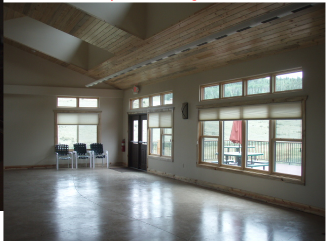
Large Floor area for ???- Dancing?