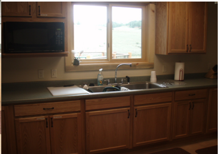
Huge sink and lots of counter space